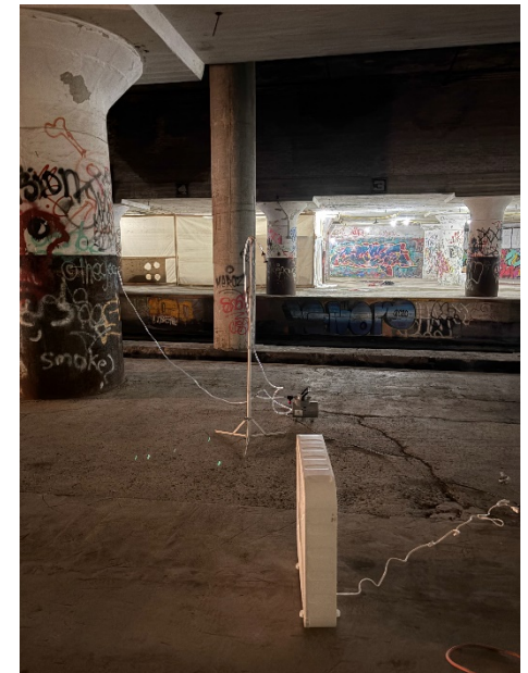
Final Air Clearance Sampling, Second Floor.